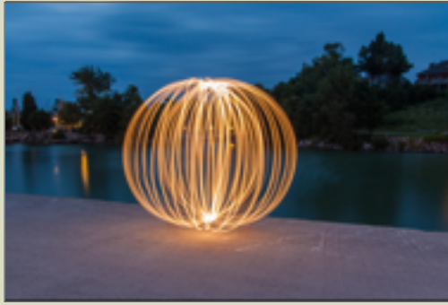
Night Photography Bayfield Beach