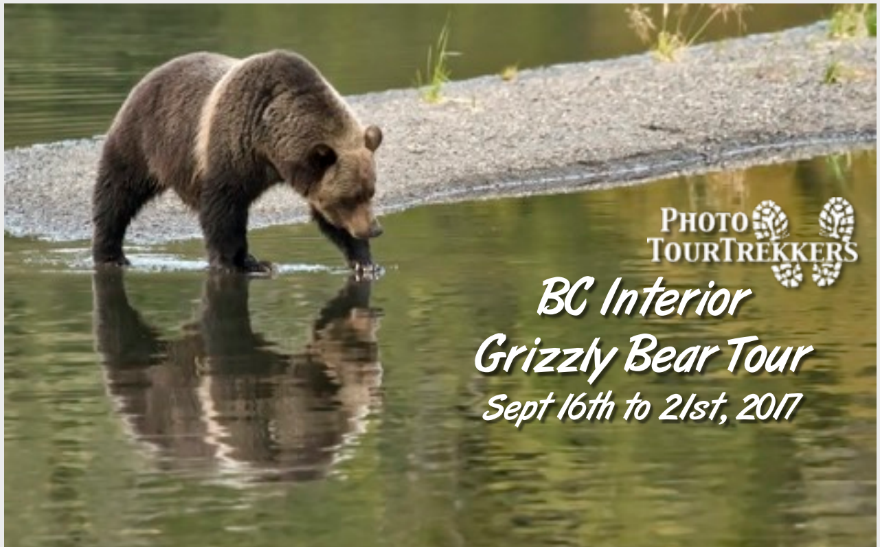
PHOTO TOUR TREKKERS