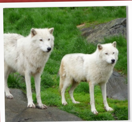
MONT TREMBLANT FALL TOUR SEPT 27TH TO 30TH, 2012

Not to far from Montebello and Park Omega is beautiful Mont Tremblant set out in fall colours. We will spend a day visiting the (con't )