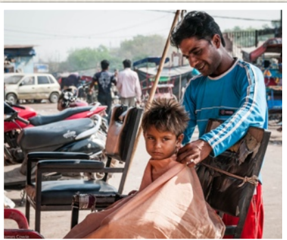
Haircut Old Delhi

Our India Photo Tour is $5990.00 CAD per person plus air taxes of $720.00, based on double occupancy, single supplement is an additional $1595.00. Package price includes KLM International flights and return internal India flights from Delhi to Varanasi. For additional information, or to download a copy of our tour brochure or book this tour, please visit www.PhotoTourTrekkers.com .