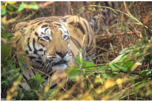
Tiger Ranthambore National Park