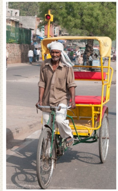
Rickshaw Old Delhi

India February 2013 - Our November India Tour has now sold out, and we have continued to have requests for space. So we are pleased to announce a second tour to India February 3rd to the 17th, 2013. This tour has limited space, we can take 15 photographers, we currently have 6 spaces available.