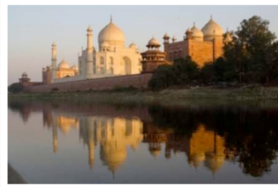
Taj Mahal at sunset