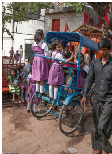
School Girls Delhi