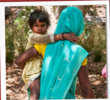
INDIA PHOTO TOUR FEB 3RD TO 17TH, 2013